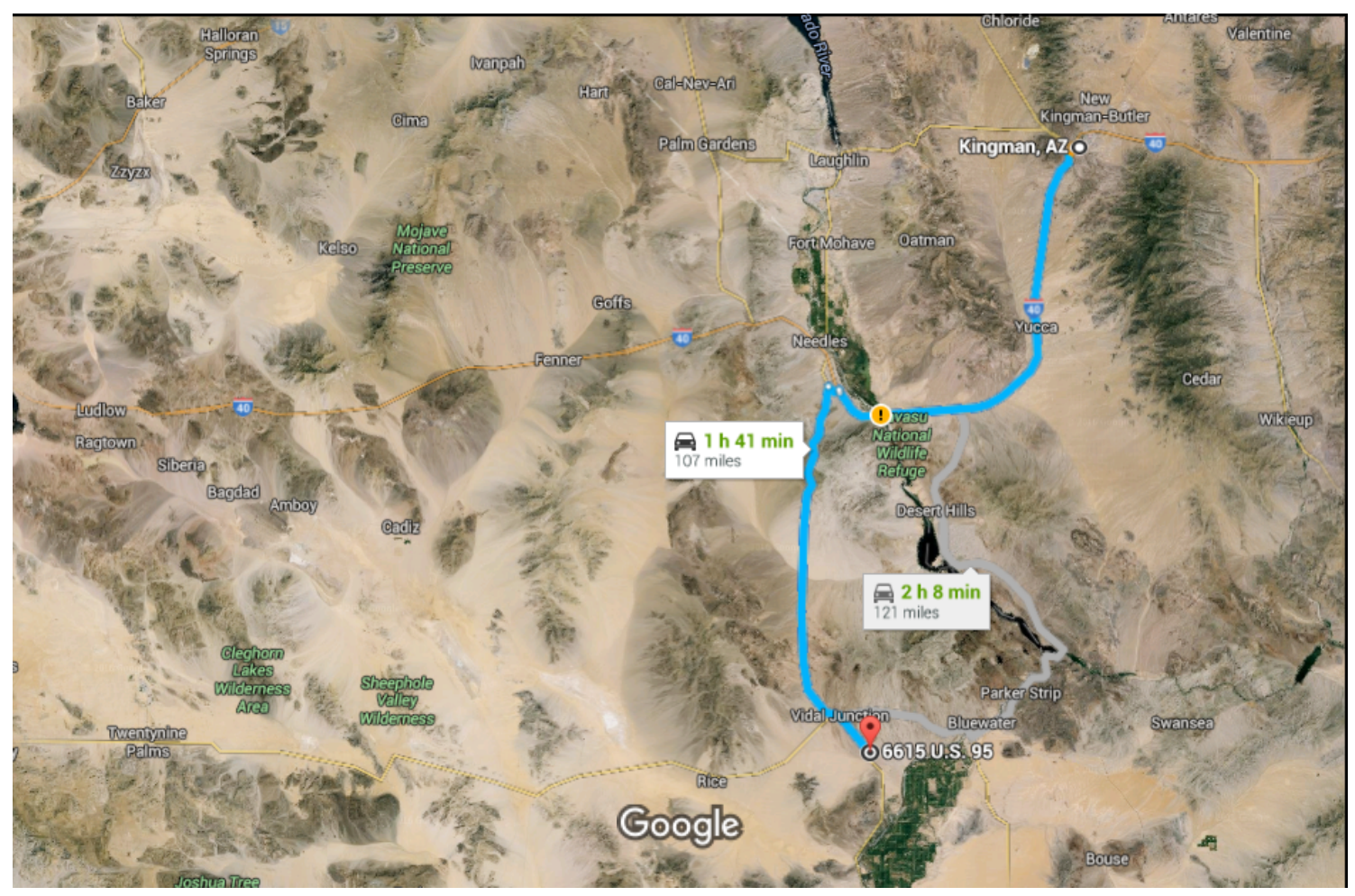
10 mi