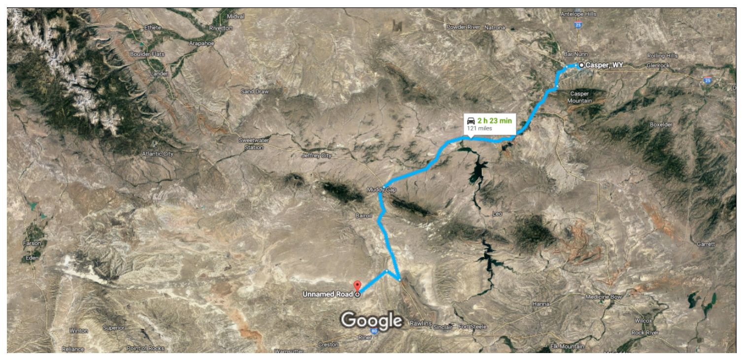
10 m