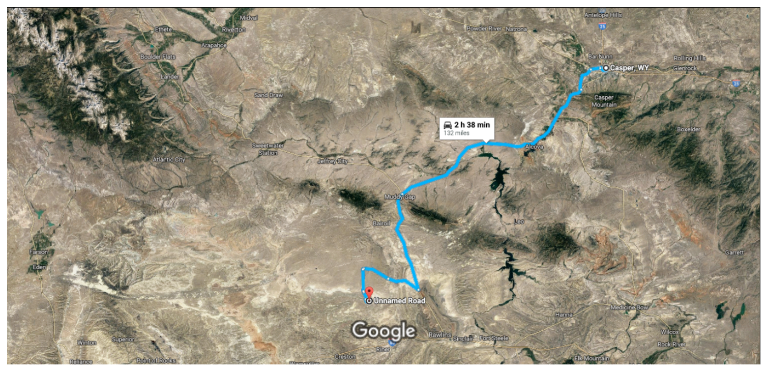
Imagery ©2016 Landsat, Map data ©2016 Google 10