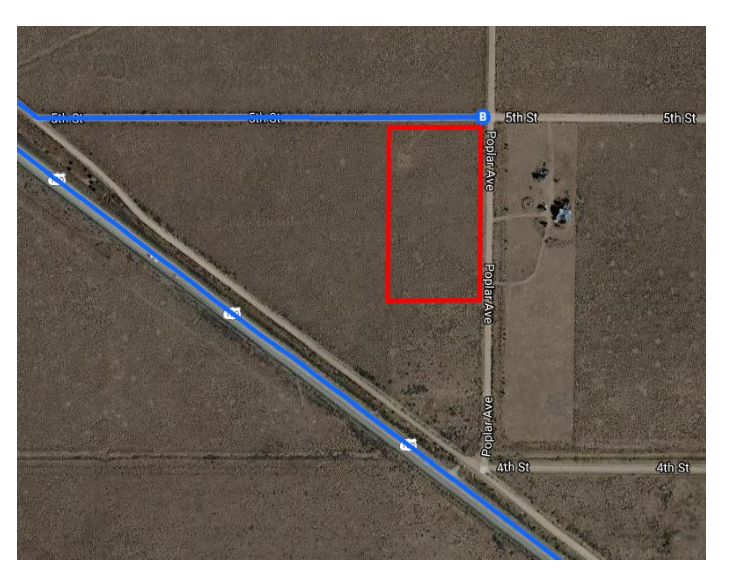
5th St Blanca, CO 81123