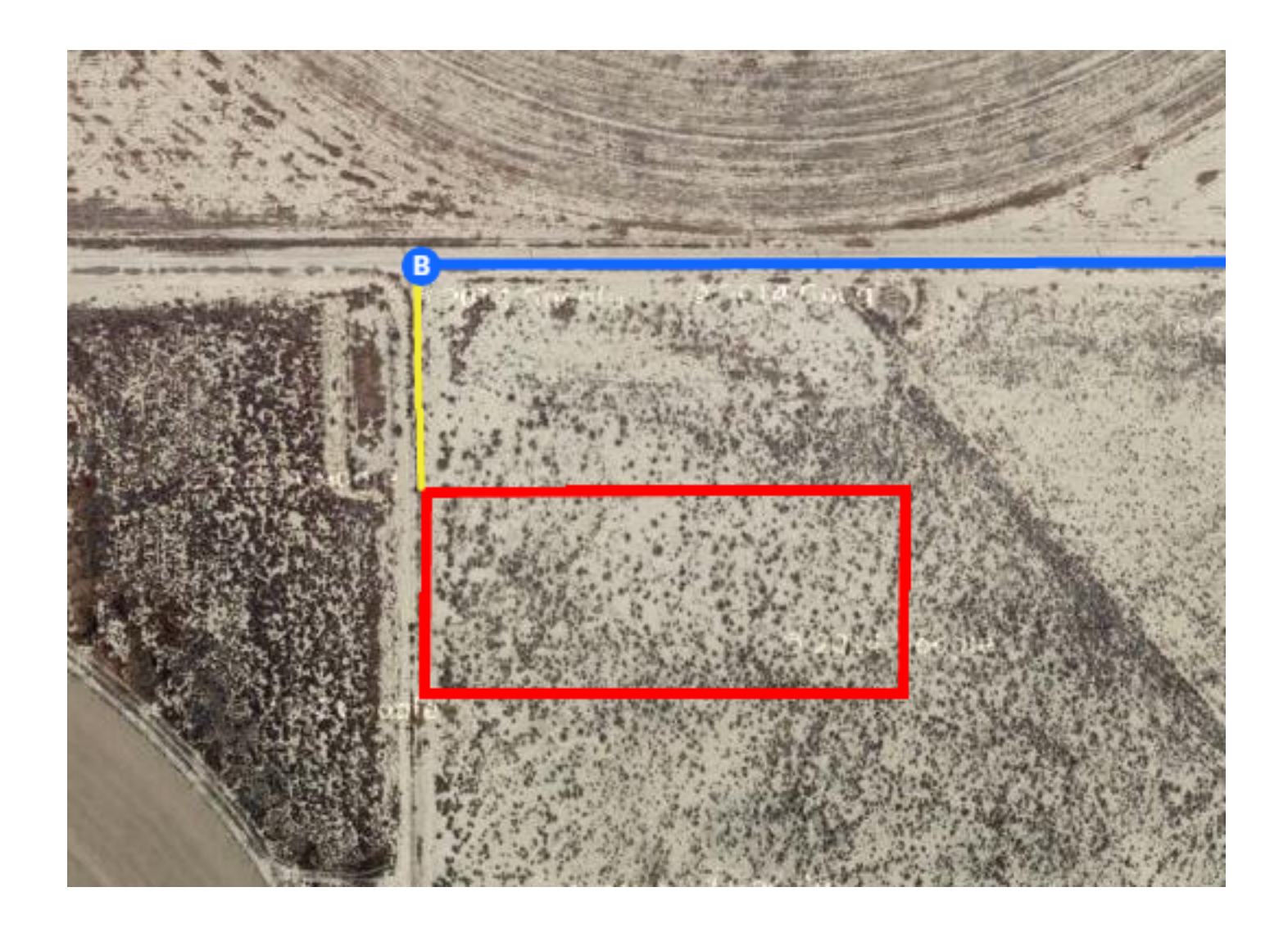
Continued Directions At the end of the Google earth directions turn left and continue along the dirt road for 337 feet. NW corner of property on left.

These directions are for planning purposes only. You may find that construction projects, traffic, weather, or other events may cause conditions to differ from the map results, and you should plan your route accordingly. You must obey all signs or notices regarding your route.